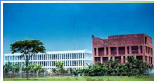
View of Permanent Campus at Satarkul, Badda, Dhaka.