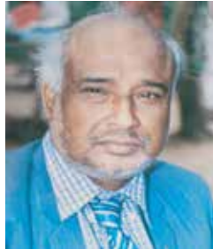
Born on January 01, 1953 Expired on February 06, 2004